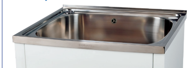
Laundry Unit with added Overflow

70024 Project 30SP Laundry Unit 70024OF Project 30SS Laundry Unit with Overflow